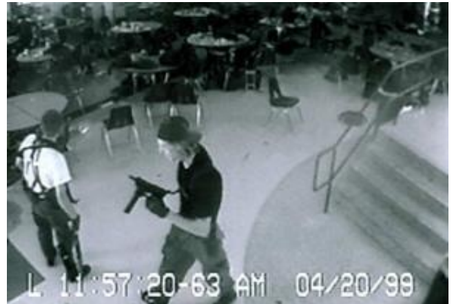
Columbine High School shooters Eric Harris, left, and Dylan Klebold were pictured in the commons shortly before their suicides.

Columbine High School surveillance photo,